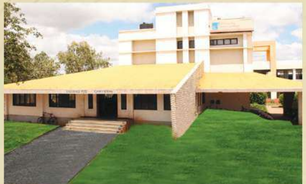
College Canteen & Canara Bank