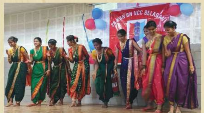
NCC Day Celebration