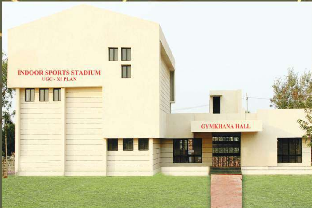
Indoor Sports Stadium