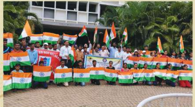
Rally on "Har Ghar Tiranga"