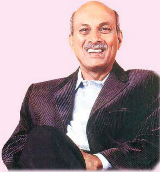
Dr. Prabhakar B. Kore Ex-M.P.

Chairman Board of Management, K.L.E. Society, Belagavi