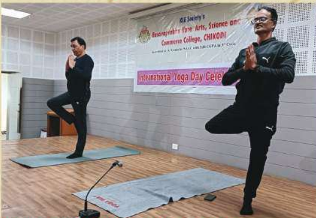
International Yoga Day Celebration