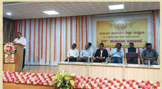
KLE Foundation Day Celebration