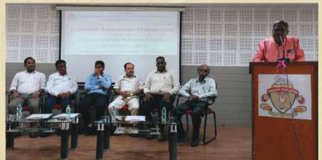
Electoral Awareness Programme