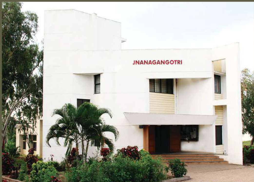
Our College Library Department