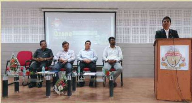
World Ozone Day Celebration