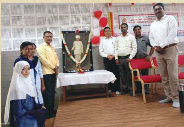
Shrimant Basavaprabhu Kore Jayanti Celebration